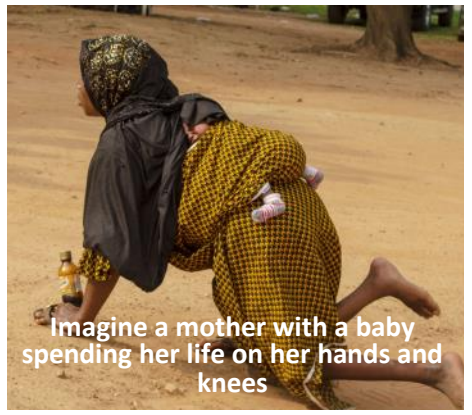
Imagine a mother with a baby spending her life on her hands and knees