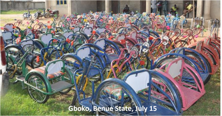
Gboko, Benue State, July 15

Six major distributions were held in the 2nd quarter, in Abuja and Kano, Kaduna, Bauchi and Benue States.