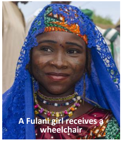
A Fulani girl receives a wheelchair