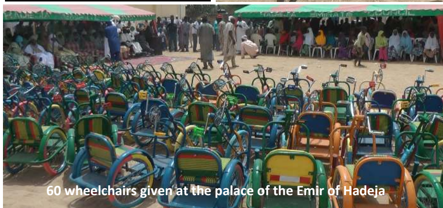
60 wheelchairs given at the palace of the Emir of Hadeja