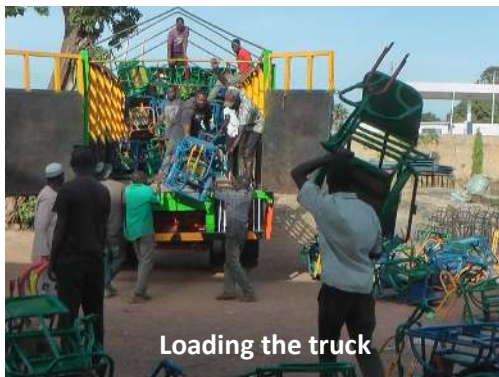
Loading the truck