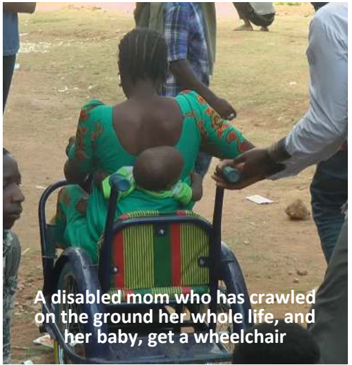
A disabled mom who has crawled on the ground her whole life, and her baby, get a wheelchair

THANK YOU, supporters of Wheelchairs for Nigeria! Because of your generosity, 17,000 polio survivor's lives have been transformed, from crawling on the ground to having mobility to go to school, church, market or a job.