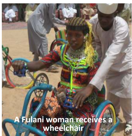
A Fulani woman receives a wheelchair