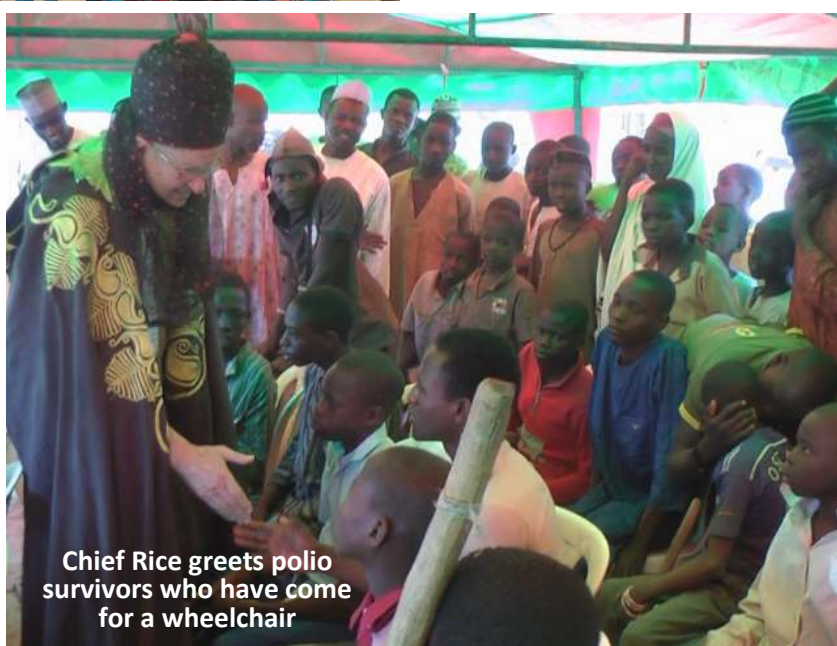
Chief Rice greets polio survivors who have come for a wheelchair