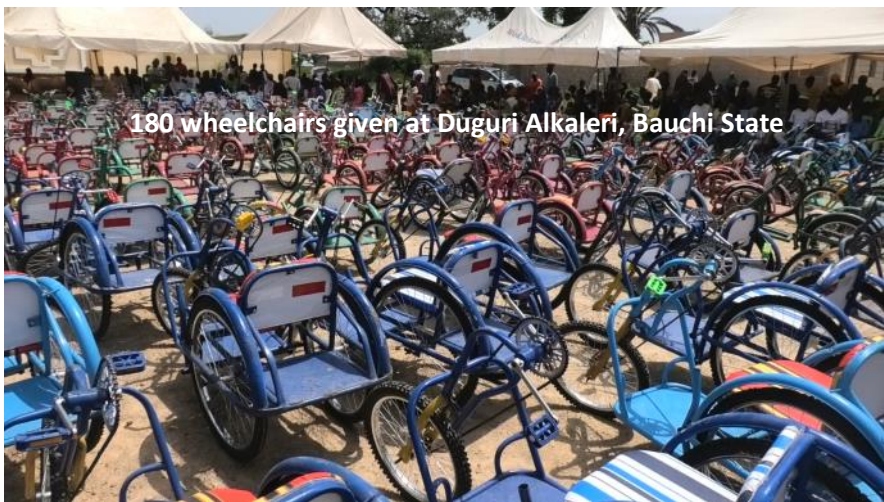
180 wheelchairs given at Duguri Alkaleri, Bauchi State