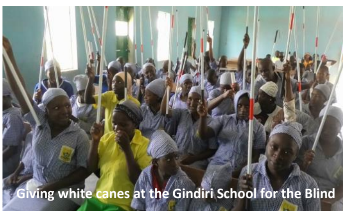
Giving white canes at the Gindiri School for the Blind