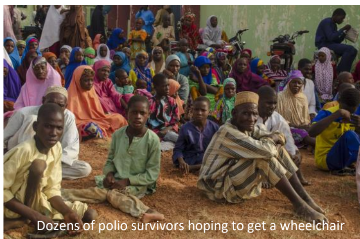
Dozens of polio survivors hoping to get a wheelchair