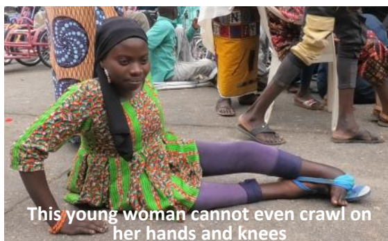
This young woman cannot even crawl on her hands and knees