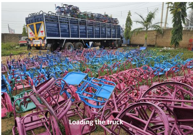
Loading the truck