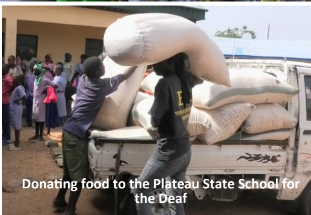
Donating food to the Plateau State School for the Deaf