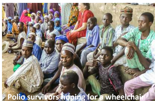
Polio survivors hoping for a wheelchair