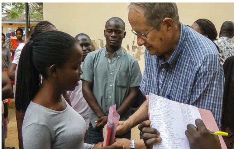
80 folding white canes given to blind students