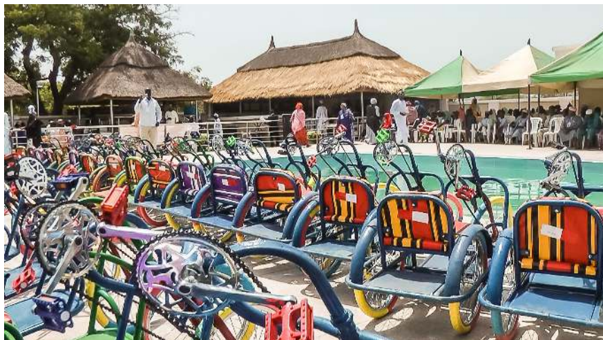
100 wheelchairs given in the city of Bauchi