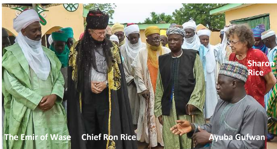
The Emir of Wase