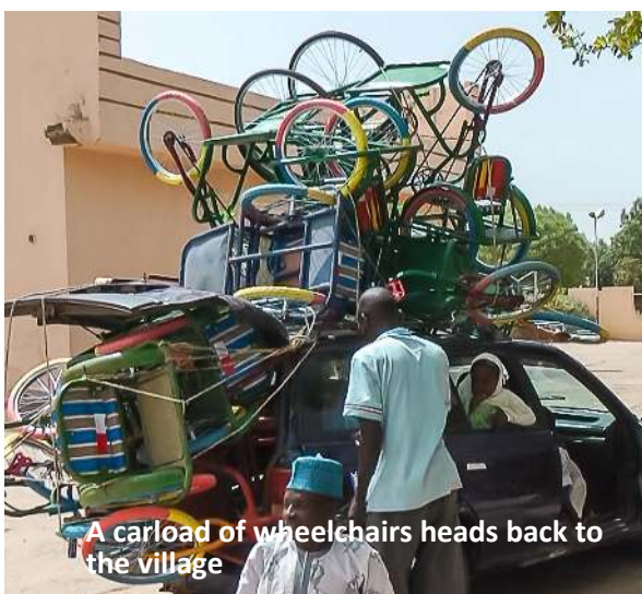
A carload of wheelchairs heads back to the village