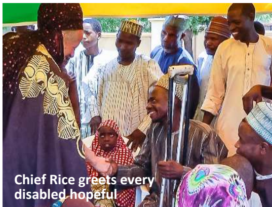
Chief Rice greets every disabled hopeful