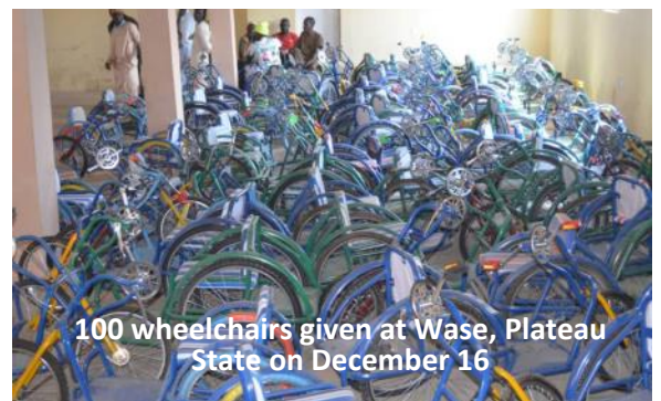
100 wheelchairs given at Wase, Plateau State on December 16