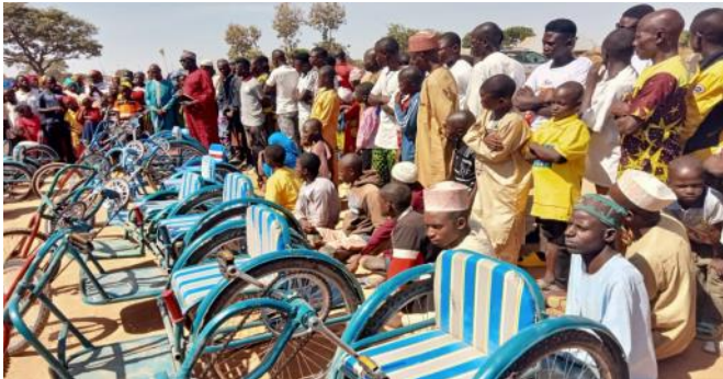
20 wheelchairs given at a Catholic church in Kaduna