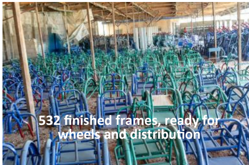
532 finished frames, ready for wheels and distribution

The wheelchair shop has set a new record this year, 2316 wheelchairs distributed and another 532 finished and ready for distribution. This makes a grand total of 25,500 wheelchairs since the beginning.