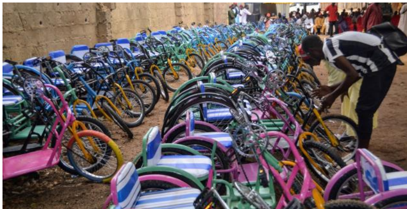
100 wheelchairs given at Wadil Garka, Kano State