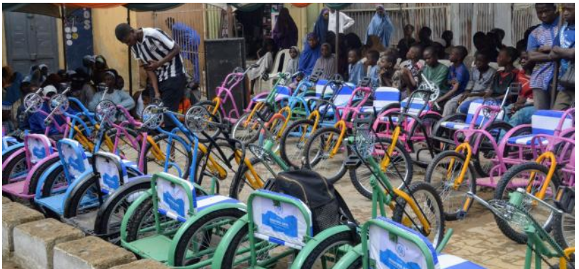
100 wheelchairs given at Kofarmata, Kano State

Year to date, 1578 tricycle/wheelchairs have been given in 19 major distributions in 12 states. A total of 38,404 wheelchairs have been given from the beginning.