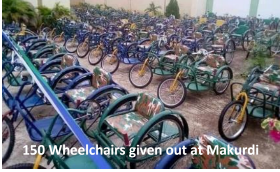
150 Wheelchairs given out at Makurdi