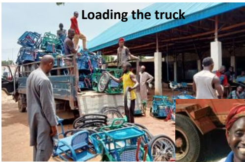
Loading the truck