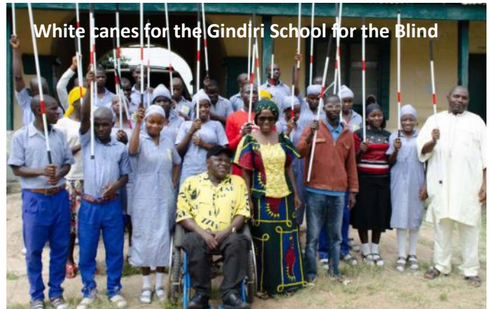
White canes for the Gindiri School for the Blind

On Oct. 28 Ayuba visited the deaf school we have been helping and came away in tears. There was not one grain of food for the 400+ deaf students. After consulting with Ron he purchased 22 bags of maize, 8 of millet, 5 of rice, 4 of beans, 5 of garri and 5 jerry cans of palm oil, enough for the remaining 7 weeks of the term.