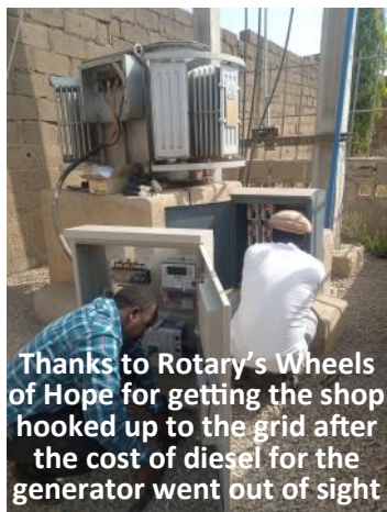
Thanks to Rotary's Wheels of Hope for getting the shop hooked up to the grid after the cost of diesel for the generator went out of sight