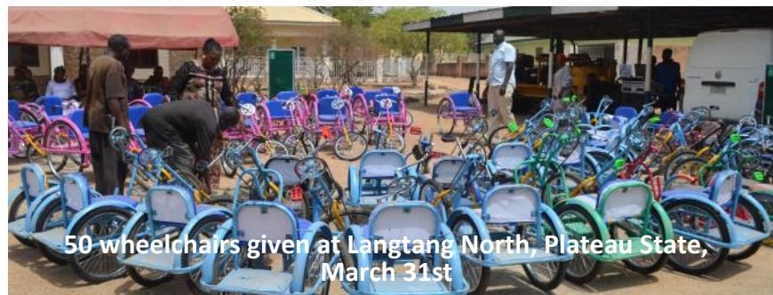
50 wheelchairs given at Langtang North, Plateau State, March 31st